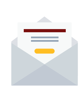
45.3% Increase in Automated